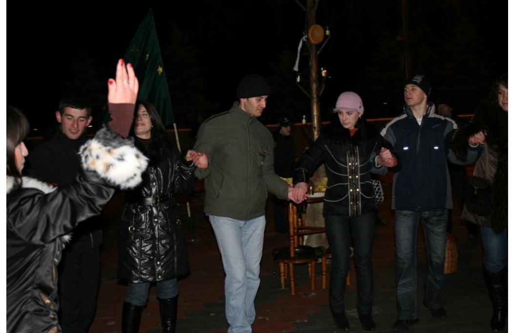
Modern-day Circassians celebrating the Birth (or Return) of the Sun (дыгъэгъазэ; Digheghaze ) on 22 December 2007 in Nalchik. This is the time when the sun reaches its lowest apparent point in the sky and starts to rise up, a propitious occasion for an agrarian-pastoral society. This is one of a number of pre-historic festivals that have been resurrected in the new millennium. The pole in the background is the principal emblem of this celebration. The round loaf of bread high on the pole is an ancient folkloric depiction of the sun-god.