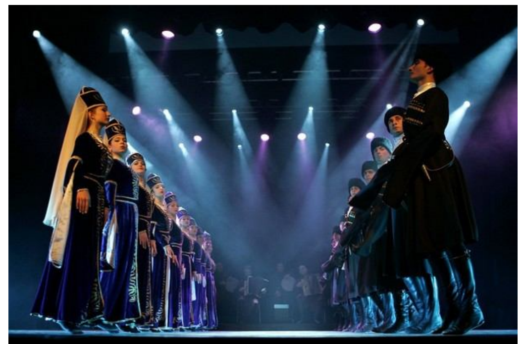
Al-Ahli Circassian Dance Troupe 'Kuban' performing under Royal patronage in Amman/Jordan in March 2009.

In the diaspora, dance is the main, and often the only, manifestation of national folklore. In many societies it is the activity most identified with Adiga culture and is readily associated with it by non-Circassians, perhaps to the detriment of other folkloric genres.