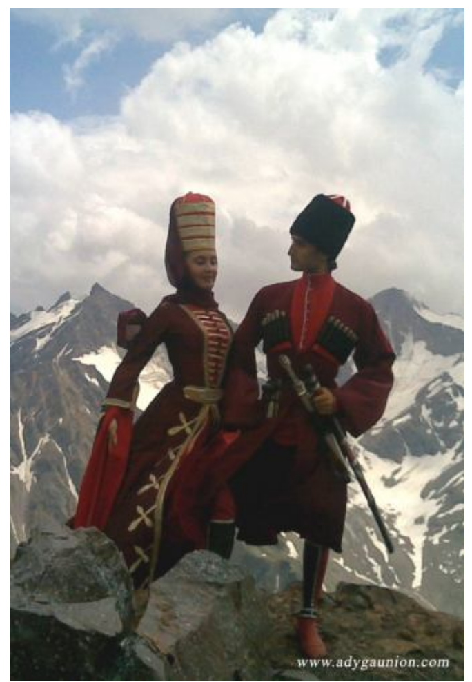
Two members of the National Dance Ensemble 'Hetiy' on top of the Caucasus Mountains.