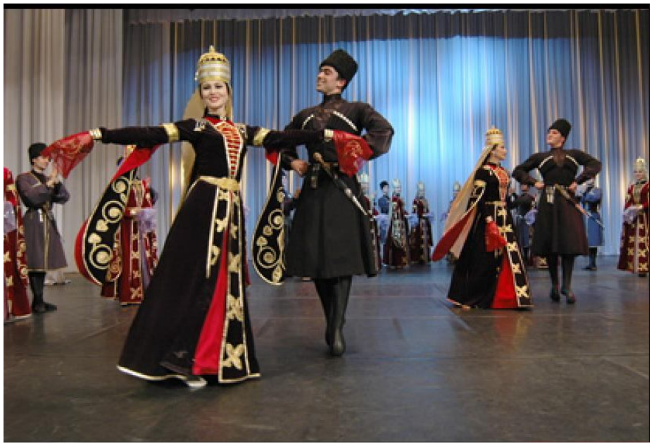
The Adigean State Academic Folk Dance Ensemble 'Nalmes'. Established in 1936, 'Nalmes' sees itself as 'the collector, guardian, and interpreter of Adigean folk music and dancing'.

'Nalmes', a folk song and dance group which was set up in the early 1970s, although it was first established in the 1930s, but was later dissolved.<sup>6</sup>