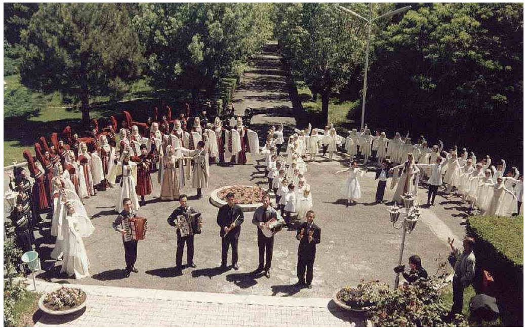
Stylised depiction of Circassian dance party.