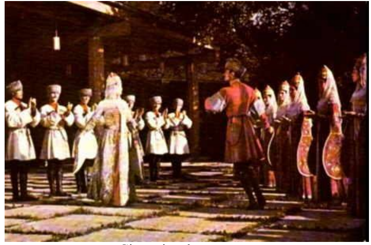
Circassian dance party.

A dance party was started with the stately slow dance «къафэ» ( qafe ),<sup>4</sup> and ended with the solemn round dance «удж» ( wij ), in accordance with the saying, «Джэгур къафэкІэ къыщІадзэри, уджкІэ яух» (' Jegwr qafech'e qisch'adzeriy, wijch'e yawix' ) ['A dance party is started with «къафэ» ( qafe ), and ended with «удж» ( wij )']. Male dancers had to follow the moves of their female partners and harmonize with them. A female dancer always stayed on the right of her partner, and never associated with dancers of lesser social rank.<sup>5</sup> When a prince joined a dance party and took the floor, the bards paid deference to his noble demeanour by playing songs associated with his family and lineage, clapping and chorus assuming more sober and measured rhythms.