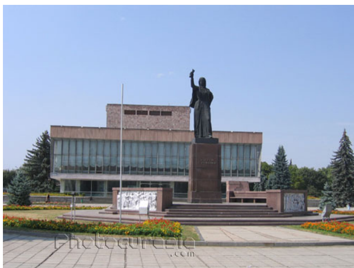
Statue of Princess Maria (Gwascheney) Teimriqwe Yidar, second wife of Russian Tsar Ivan the Terrible (betrothed in 1561). This is a controversial monument erected in Nalchik in 1957 to mark the fourth centennial of the 'Union' of Kabarda and Russia.

Temryukovna (Мария Темрюковна; 1544-1569), as was Gwascheney baptised upon marriage, was married to Ivan for eight years until her early death at the age of 25 on 1 September 1569. 2