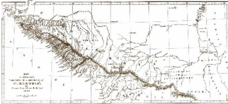
Circassia in the 19th century.

The once mighty Circassians were subjected to systematic genocide and ethnic cleansing by the Russians in the 18th and 19th centuries.