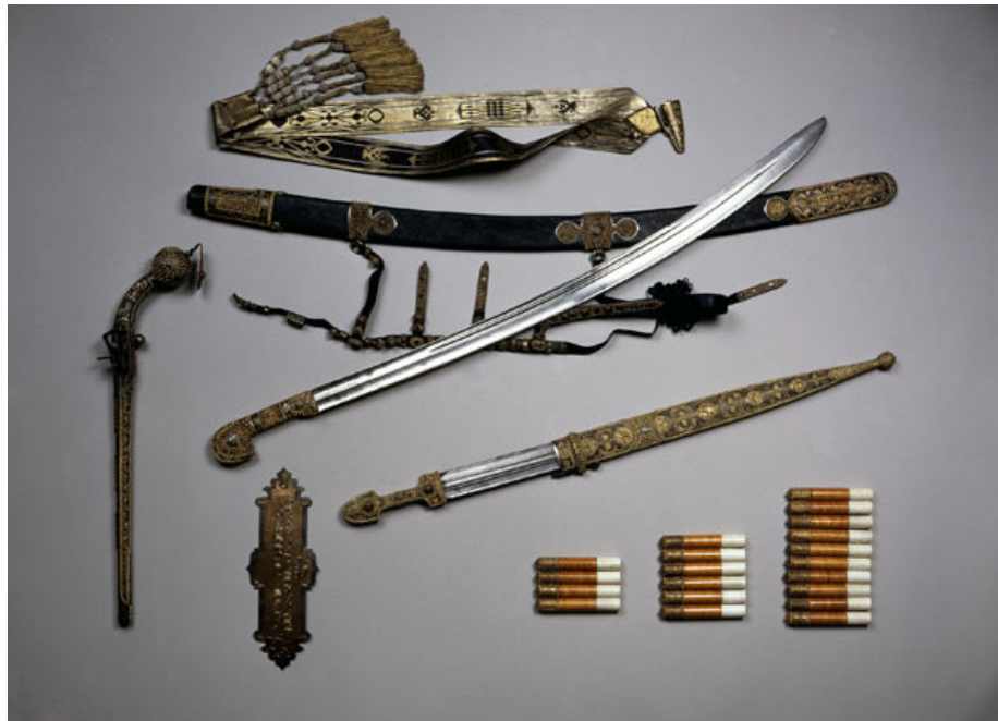
Full weapon set of Kabardian warrior (sword with sword-belt, dagger, pistol, cartridge cases). The set was presented to Tzarevich Nikolai Alexandrovich (future emperor Nicholas II) in 1888 by a North Caucasian deputation.

The last Kabardian Prince of Princes was Kwshikw Zhanx'wet (Жанхъуэт и къуэ Кушыку), who ruled Kabarda in the period 1809-1822. By his death in 1830, a dynasty that went back to the 14th century AD came to an end.