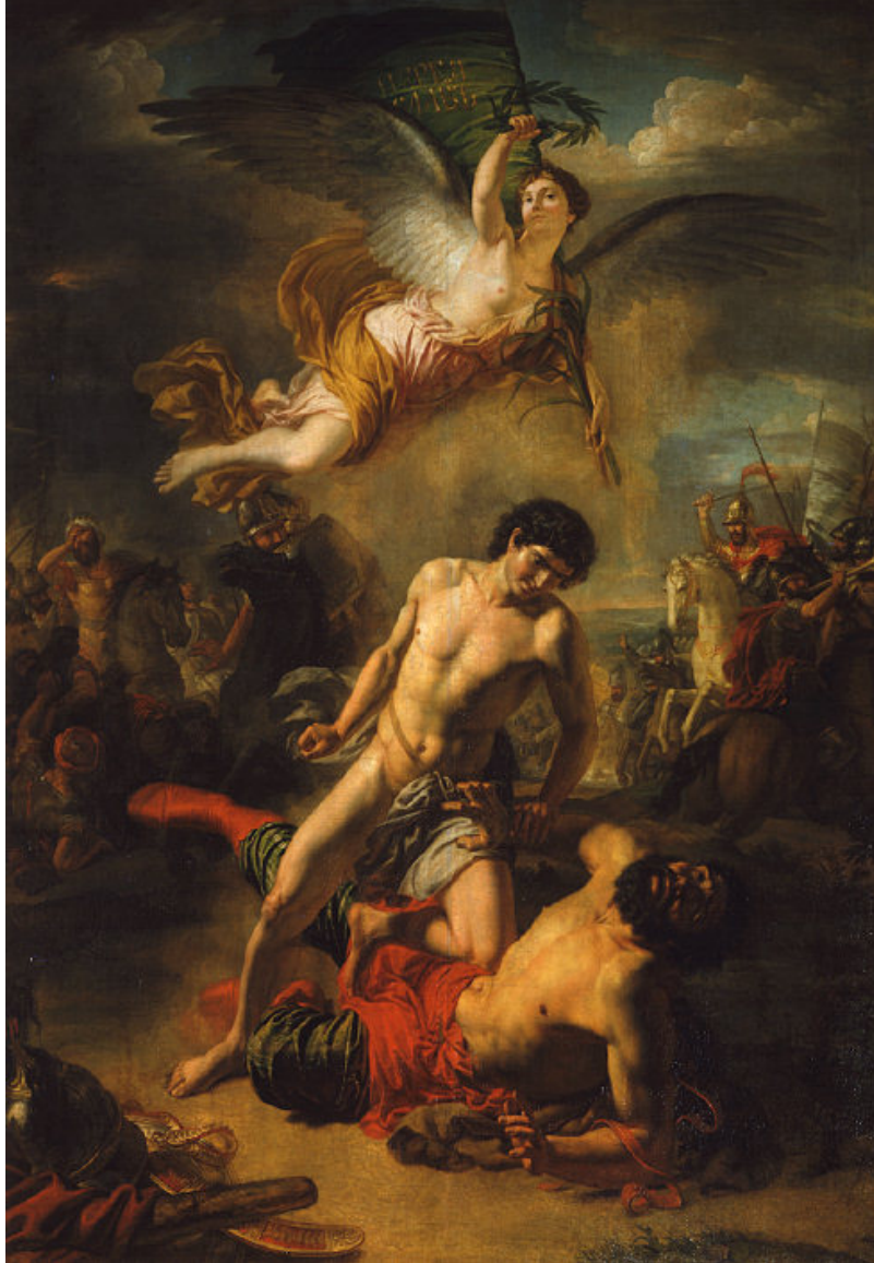
Clash of the Titans.

(Russian) portrayal of the epic combat of the Russian Prince MstislavVladimirovich the Bold (of Tmutarakan) with the Kassog Prince Rededya (Reidade) in 1022 AD. [Portrait by A. I. Ivanov, 'Duel between Prince Mstislav Vladimirovich the Bold and Kosog Prince Rededya', 1812.]